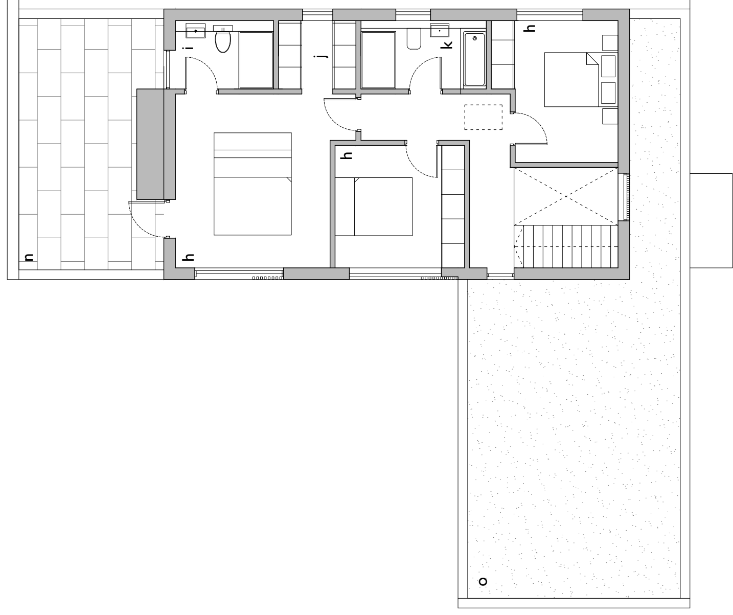
02 PROPOSED 1F PLAN